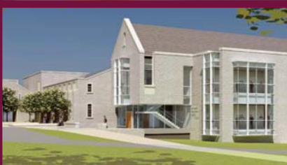
East Courtyard of Fayfield Hall