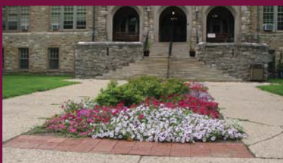
Front of St. Mary's Hall