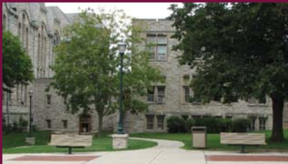
Front Walk of Dobbin Hall