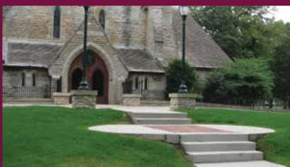
Chapel of the Good Shepherd